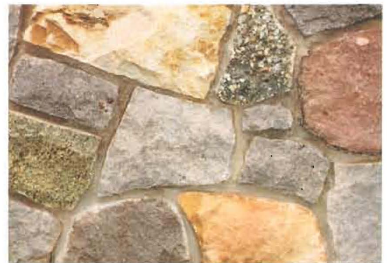
Colonial blend of Delaware Valley Fieldstone.